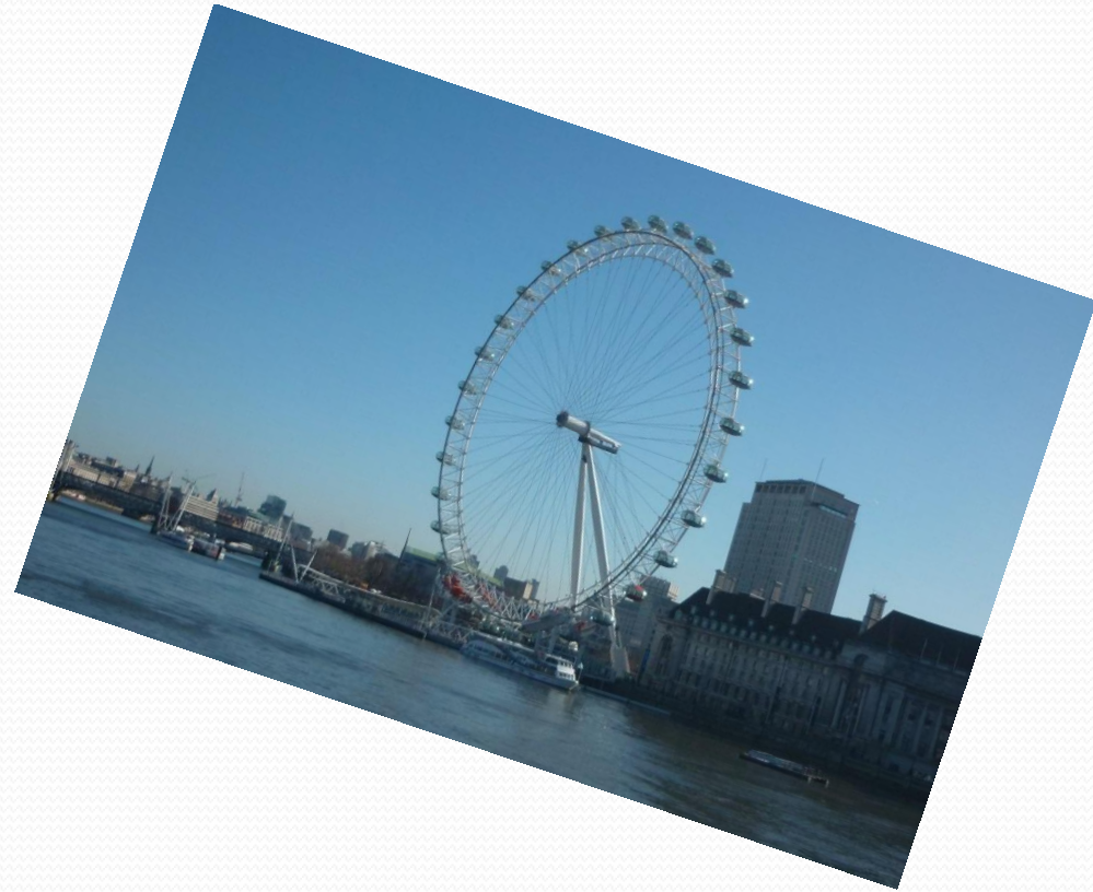
Big Ben and the London Eye