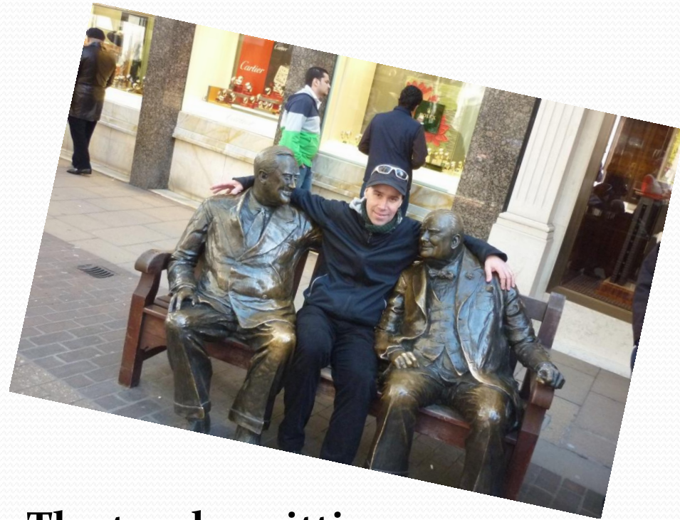
The teacher sitting between F.D.R. and Winston Churchill